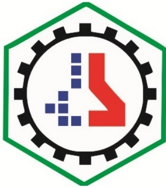
Taha Kimia TajhizCo.