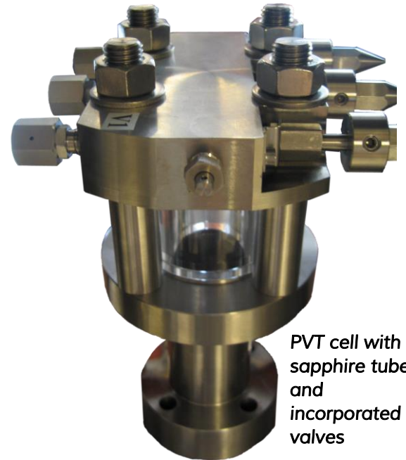
PVT cell with sapphire tube and incorporated valves