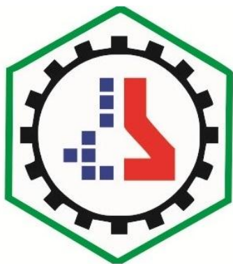
Taha Kimia Tajhiz Co.