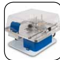
Optional: PETG high-impact, copolymer splash hood