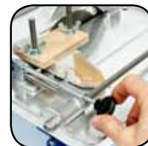
Optional: Adjustable rock vise clamp system cross feed adjustment