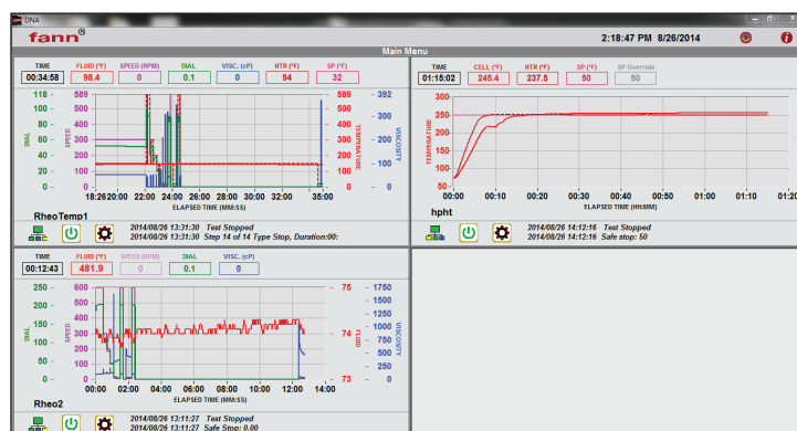
Graphical results of 3 tests running simultaneously.

The DNA box has USB computer connection and RJ45 serial ports for connecting 8 individual machines or 4 machine combinations, maximum.