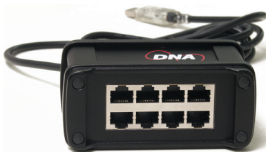
RJ 45 serial ports (8) 1 USB connection