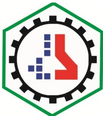
Taha Kimia Tajhiz Co.